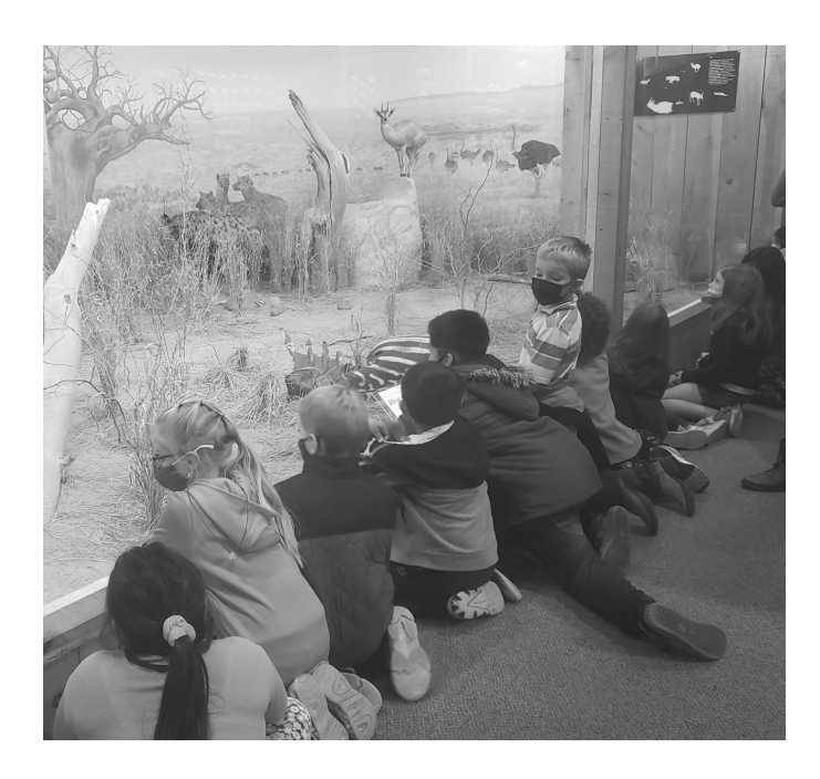
The 2nd graders took a field trip to the Natural History Museum and Planetarium at UWSP. Afterward, they had a picnic lunch at Bukolt park.